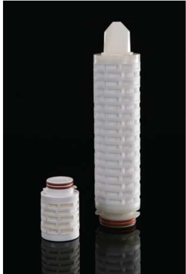
Note: BIO-X is a registered trademark of Parker domnick hunter