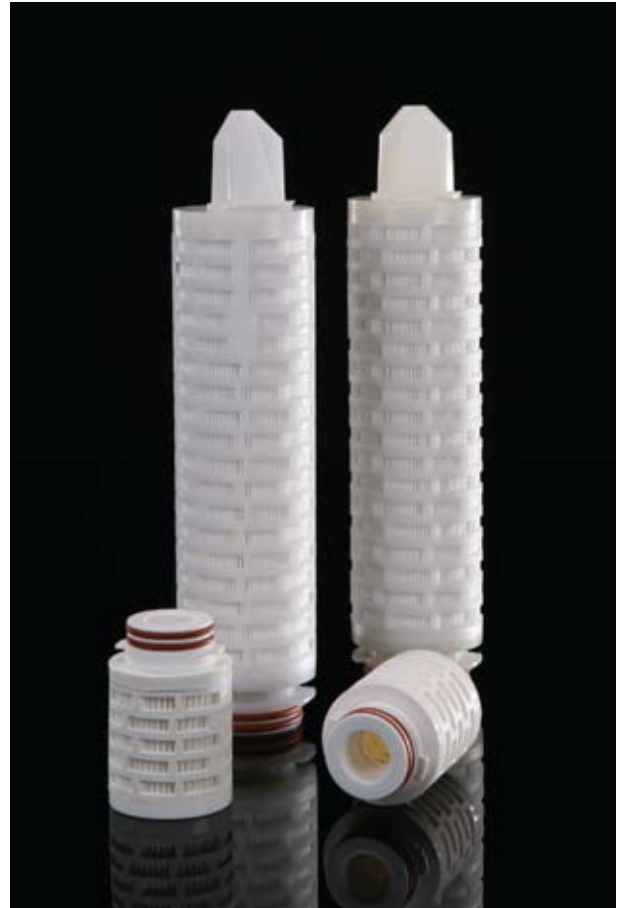
Note: TETPOR is a registered trademark of Parker domnick hunter